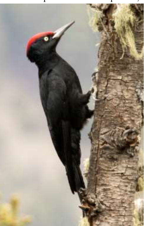
Ornitholidays Tour to China 02 – 17 May 2017 Page 12